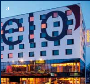
3) angelo hotel****, Katowice PL-40-086 Katowice, ul. Sokolska 24 203 rooms (opened in March 2010)