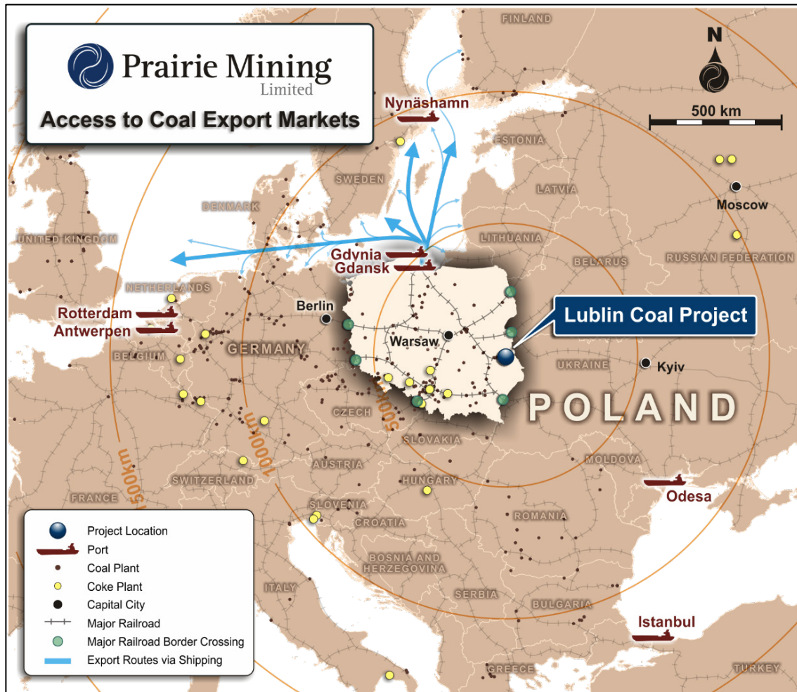
Figure 1: LCP Target Export Locations