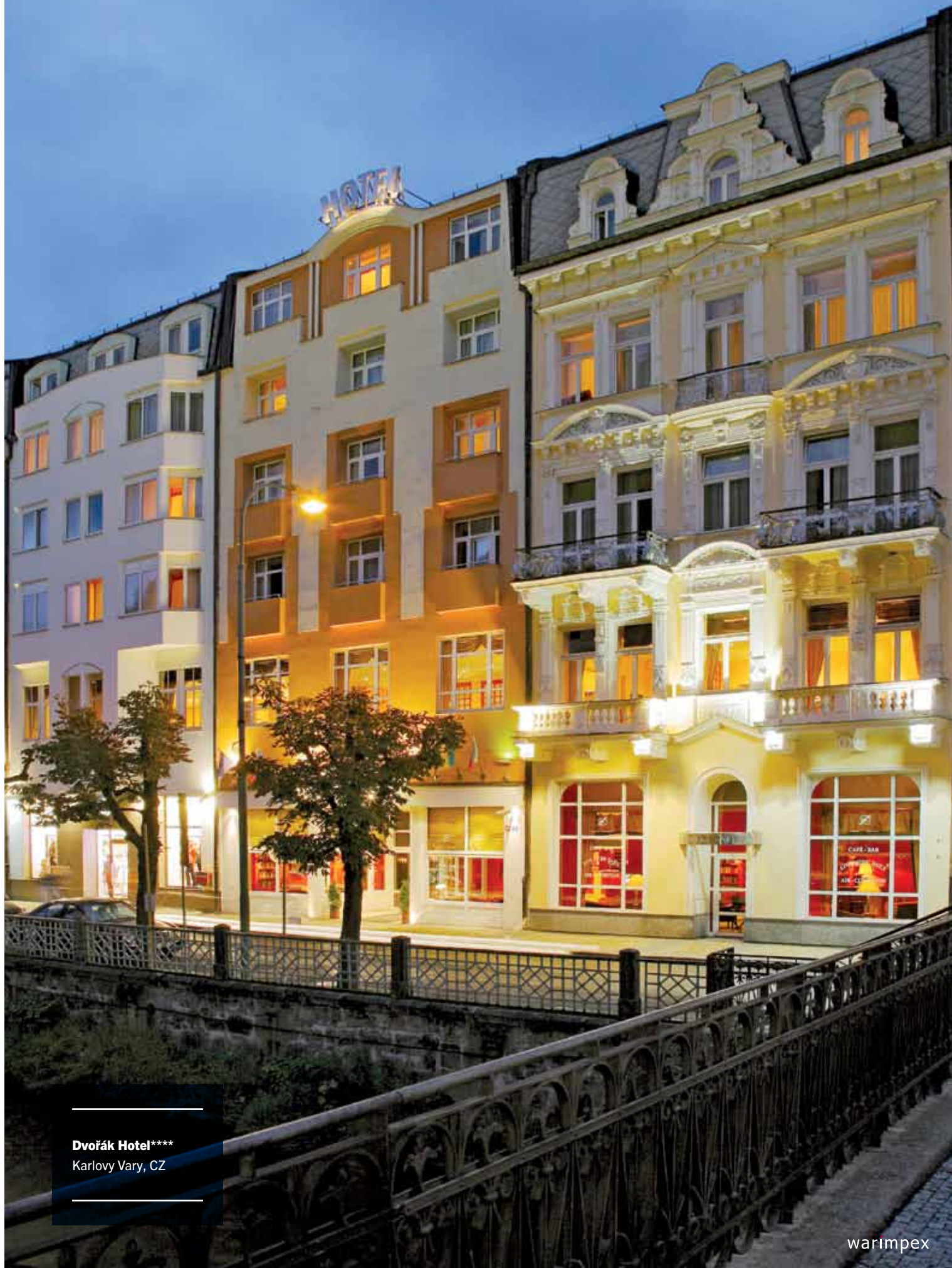
Dvořák Hotel**** Karlovy Vary, CZ